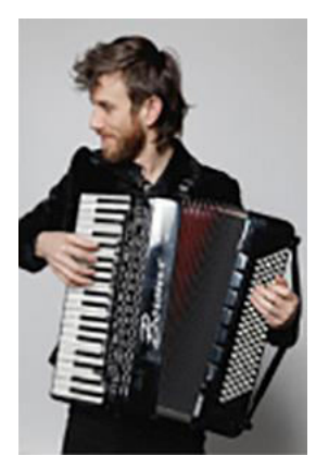
Dallas Vietty Gala Concert & Workshop Youth Outreach