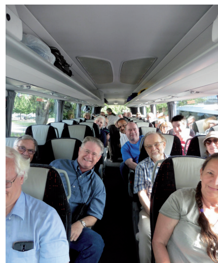
The Group en route for a factory visit