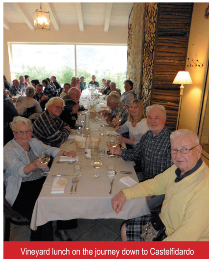
Vineyard lunch on the journey down to Castelfidardo

Our 2018 visit to 'The Home of the Accordion' took place in May consisting of accordionists from England, Ireland, Scotland, USA and Canada along with a number of partners. Our trip did not get off to the best of starts thanks to a French Air Traffic Controllers strike and we were told we may have to sit on the plane for 2 hours! After 45 minute delay British Airways managed to re-route us so we were able to make the vineyard lunch which was pre-booked for the group the other end. We met up at the airport with those we had arranged an overnight stay in Bologna the day before, mostly from USA.