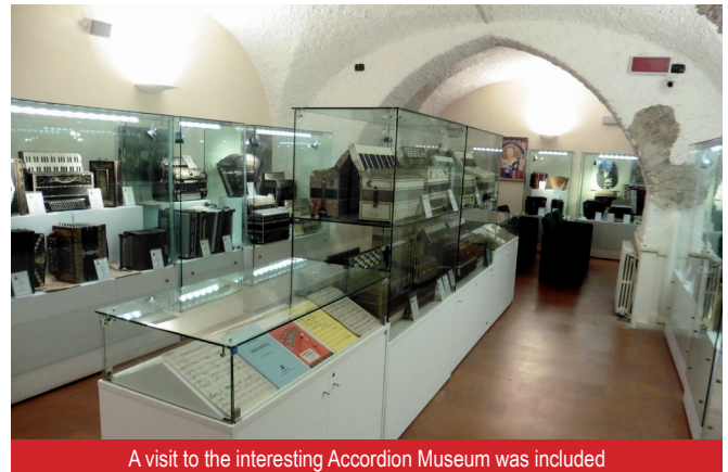
A visit to the interesting Accordion Museum was included

bar said the volume of the music was keeping them awake so the hotel asked if after 11pm we could play quietly which was a challenge for some of the players!