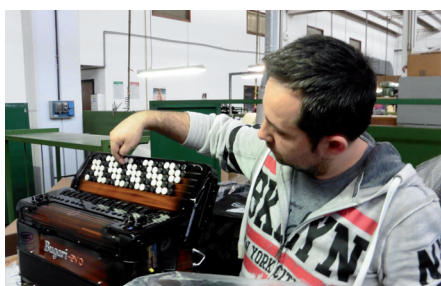
A Bugari Evo Digital Accordion has a final check in the Zero Sette/Bugari factory