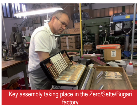
Key assembly taking place in the Zero/Sette/Bugari factory