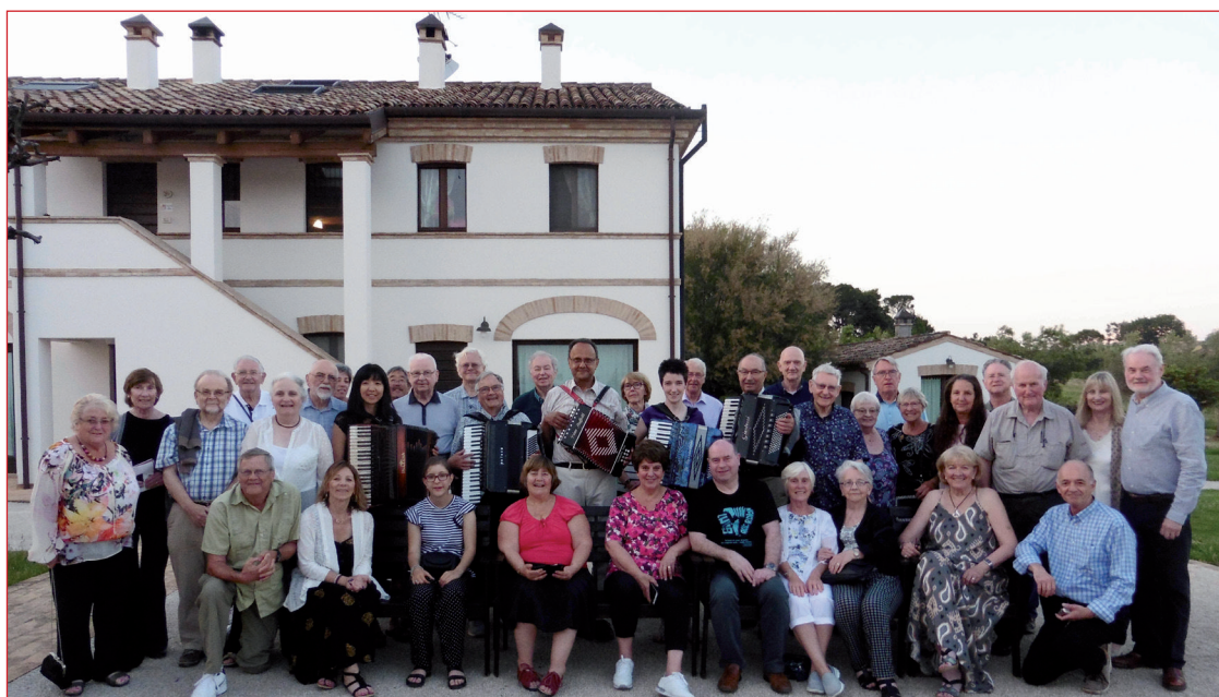
The group on the last evening at the countryside villa just before dinner