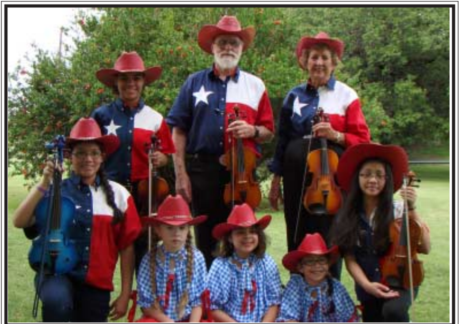
MECCA Texas Fiddlers & Cloggers