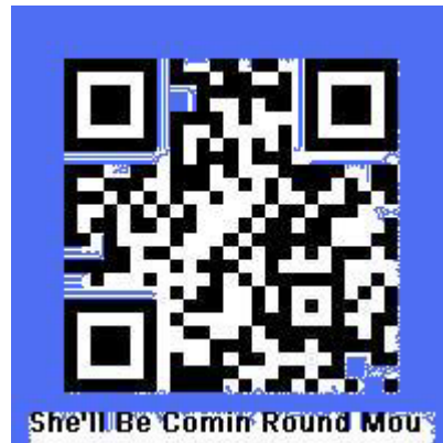
She'll Be Comin Around The Mountain