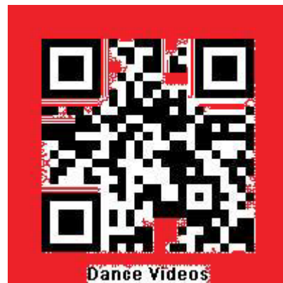
Dance Videos Texas Star Virginia Reel