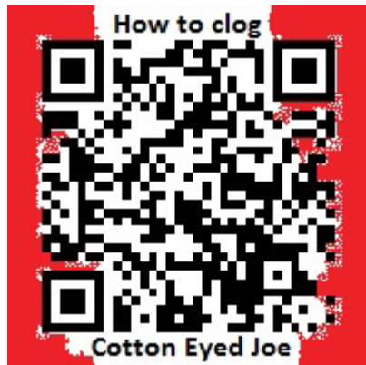
How To Clog - Cotton Eyed Joe